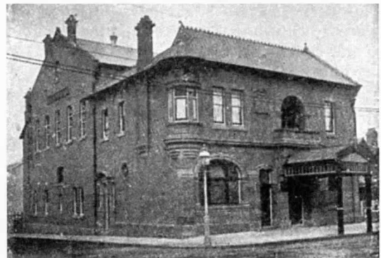
Friendly Societies' Dispensary (Jubilee Souvenir of the Municipality of Newtown 1912)

The still predominantly intact 1902 Dispensary Hall in Newtown is arguably the finest old building on Enmore Road. However the eastern wall on Reiby Street has in recent years suffered the scourge of posters, metal signage illegally bolted on, and mindless spray-painted graffiti. Instant poster removal has, for the present, curbed the bill posters. After formal complaints by residents Marrickville Council revealed the large two metal signs had been affixed by building tenants without council permission. After due process and a considerable lapse of time, these signs have now been removed, though not without damage to the brickwork. The front facade has also suffered extensive damage from careless signage removal.