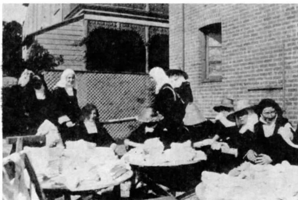
Carmelites on wash day: Montlingham at back