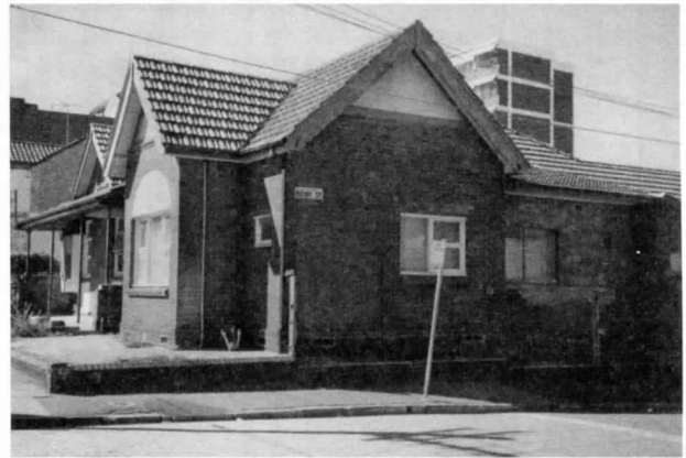
Olive Bank 80 Enmore Road

the building was used as a doctor's surgery. It is believed to have been owned by a Greek family since and 1960s rate books have it known as Vesper . For many years it has been rental accommodation with no recent improvement to the buildings.