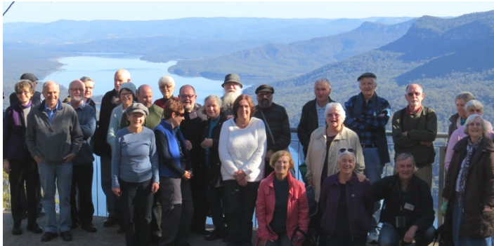
Several MHS members at scenic Burragorang Lookout during our May 2015 excursion to Macarthur country

All entries close on 6 March. The award ceremonies will be on Wednesday 4 May from 6 pm. The theme for the 2016 National Trust Heritage Festival is Discoveries and Rediscoveries .